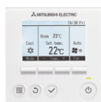
PAR-31MAA Wired Remote Controller (Optional)