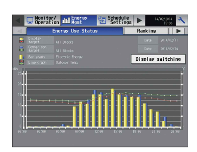
Energy Use Screen