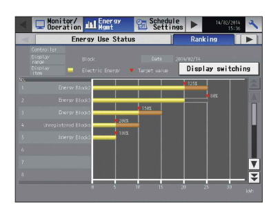
Indoor Unit Energy Consumption Ranking Screen