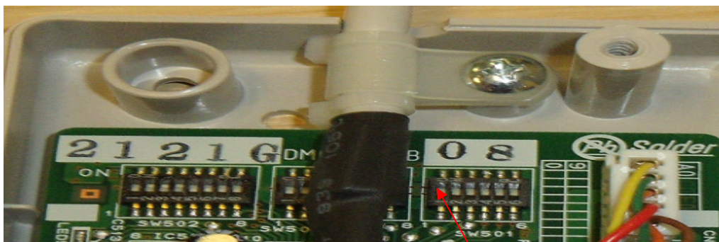
SW501 , Pin 1

As the MASTER UNIT is already addressed as "00" you will need to set an address for the SLAVE UNIT on the MAC 3971F by locating SW501 and pushing Pin 1 (up) into the ON position.