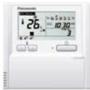
Optional Controller Timer remote controller CZ-RTC4