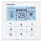
Optional Controller Wired remote controller CZ-RTC5