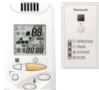
Optional Controller Wireless remote controller CZ-RWSK2 + CZ-RWSC3