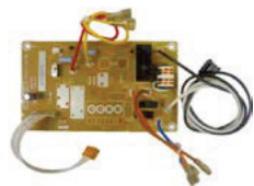
CZ-NS1P // CZ-NS3P // CZ-NS2P