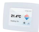
PAW-HPMED / PAW-HPMLCD