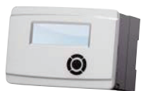
PAW-HPM1 / PAW-A2W-BIV